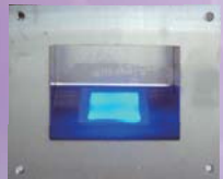
Foot Switch (BLUE : Standby)