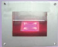
Foot Switch (RED: Detection Active)